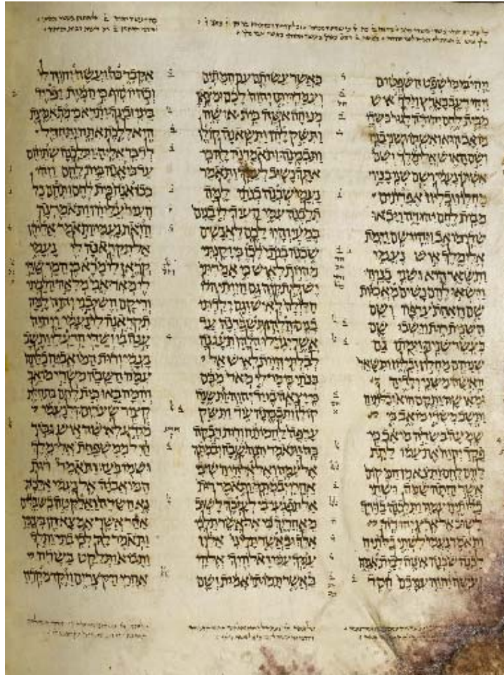
Ruth 1, the Aleppo Codex (10th c. C.E.)